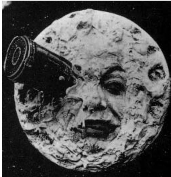
From the film A Trip to the Moon (1902)

26 In the king's palace, I saw yet another wonder. There is a huge mirror positioned over a shallow well. Anyone who descends into the well hears everything being said among our people on earth.