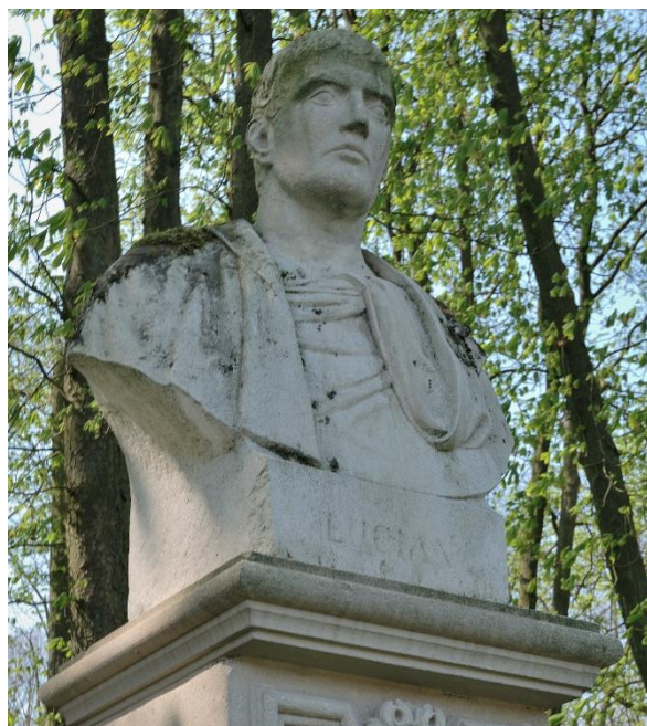
Monument commemorating Lucian of Samosata from Nordkirchen, Germany