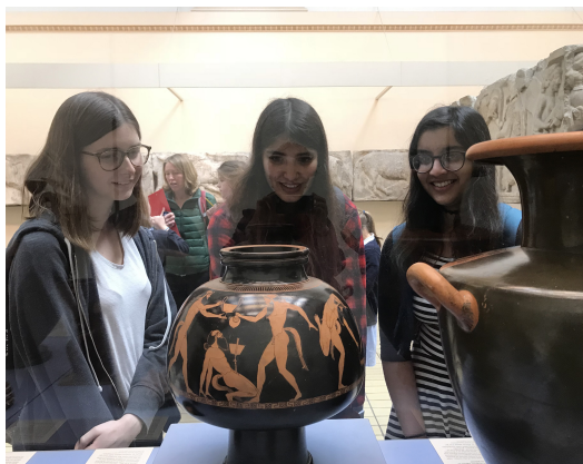
Students from Beauchamp College, Leicester, on a visit to the British Museum

Classics for All is a nationwide charity working to raise the aspirations of young people in state schools by introducing them to the wonders of the ancient world. Since our inception we have trained over 2,500 teachers to put Latin, ancient history, classical civilisation and Ancient Greek on their school timetables. This has reached over 55,000 young people across 900 primary and secondary schools, most in areas of socio-economic disadvantage.