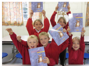
Pupils in Norfolk

History teacher and classics club leader, state secondary school in south Wales